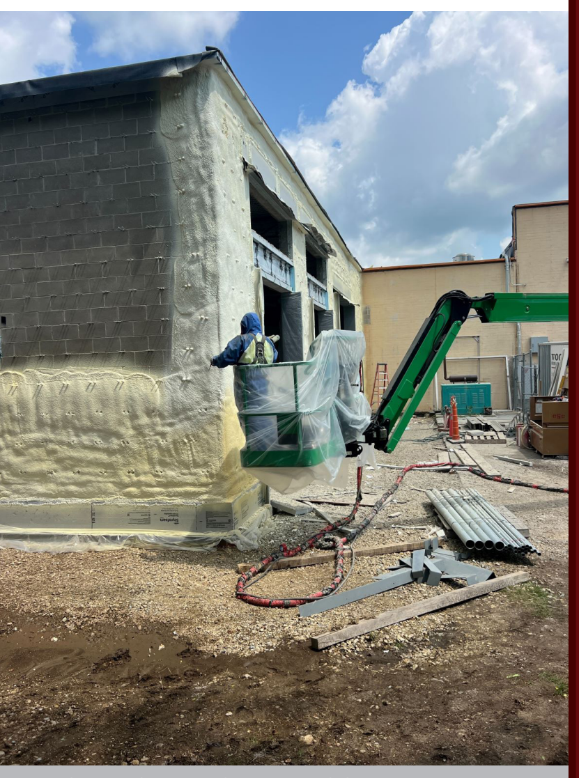
SPRAY FOAM BEING APPLIED TO CMU