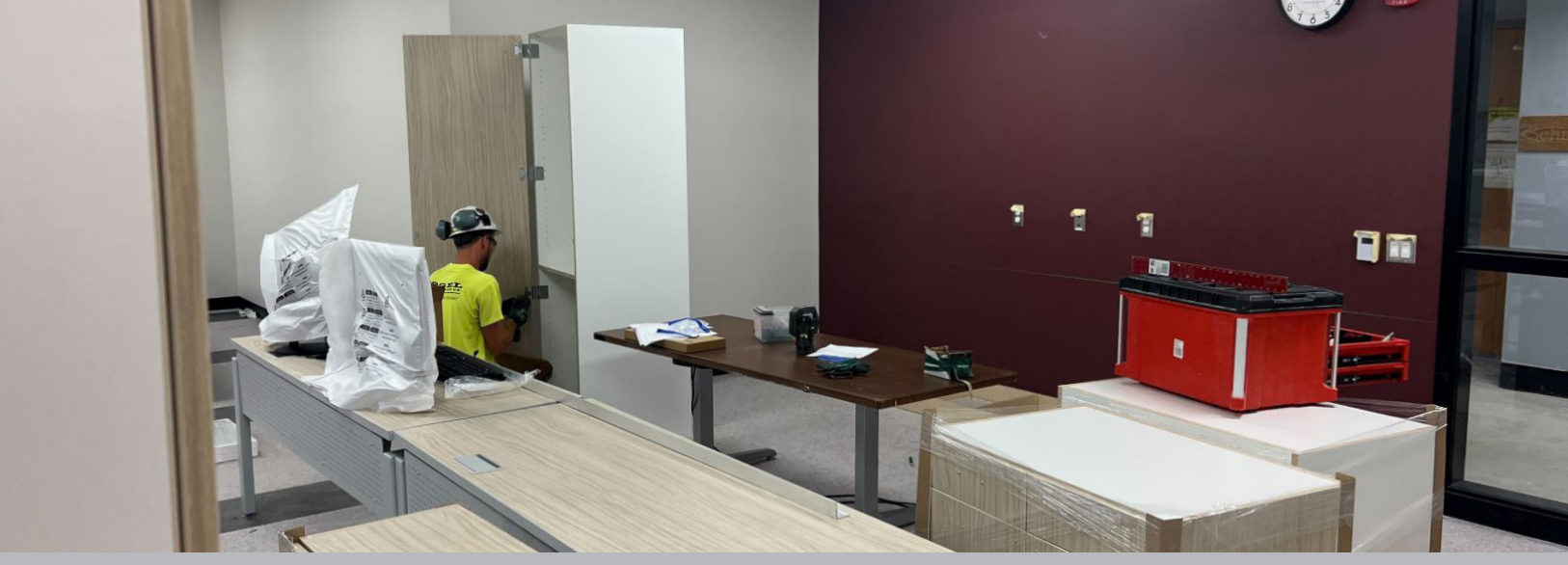
INSTALLING FURNITURE AND CASEWORK