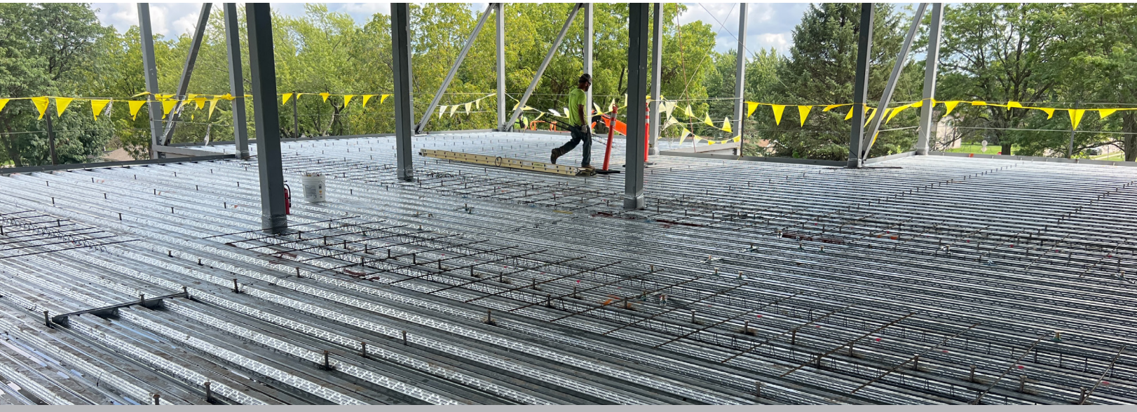
LINIT E STEEL ERECTION