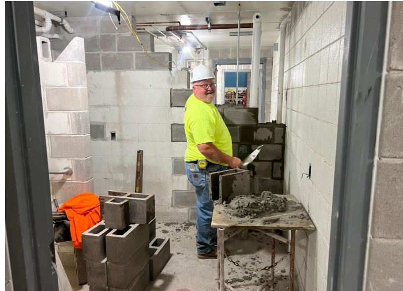
INSTALLING SHOWER STALL CMU